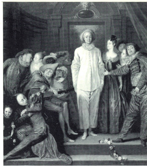
WATTEAU. Italian Comedians (detail)