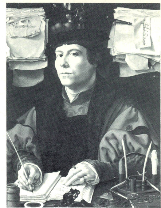
GOSSAERT. Portrait of a Banker