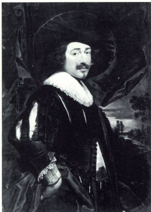
JORDAENS. Portrait of a Man