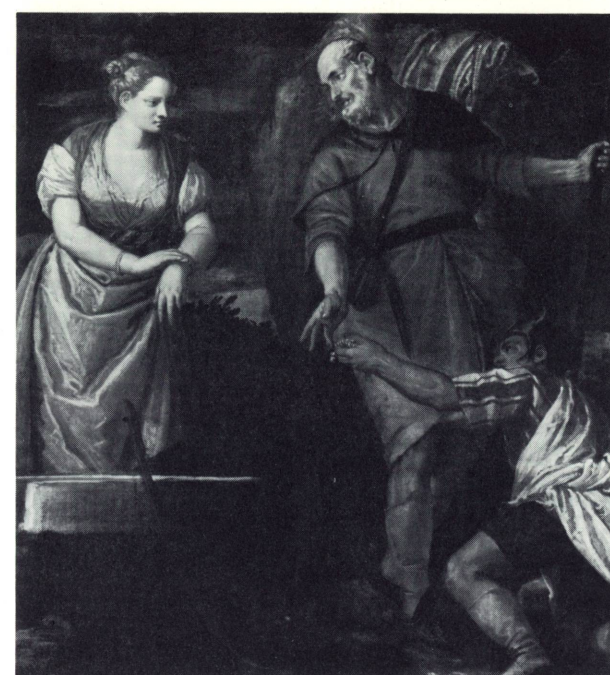
VERONESE. Rebecca at the Well (detail)