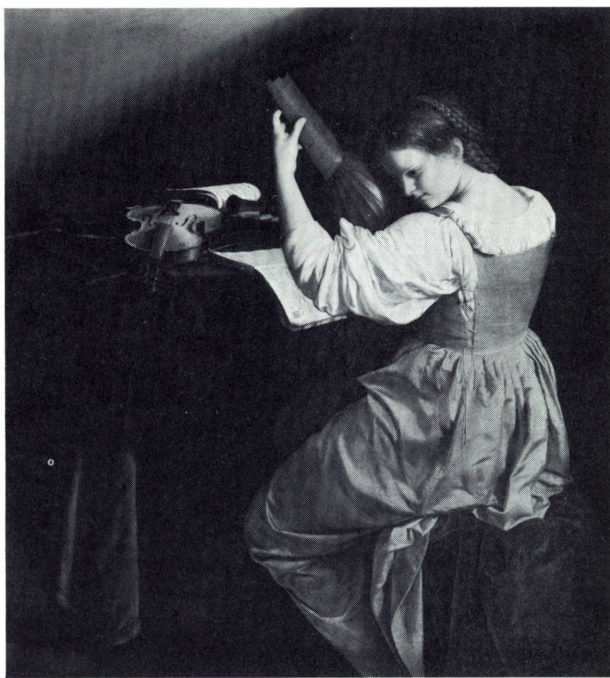
ORAZIO GENTILESCHI. The Lute Player