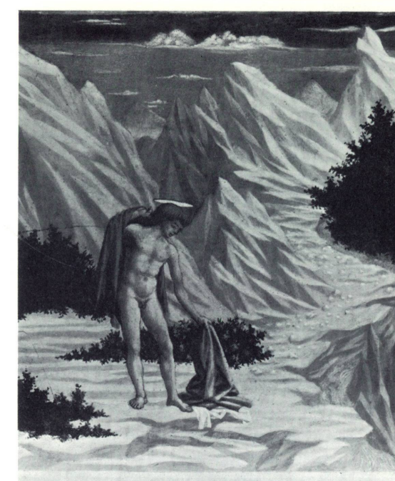
DOMENICO VENEZIANO. Saint John in the Desert (detail)