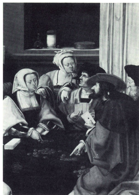
LUCAS VAN LEYDEN. The Card Players (detail)