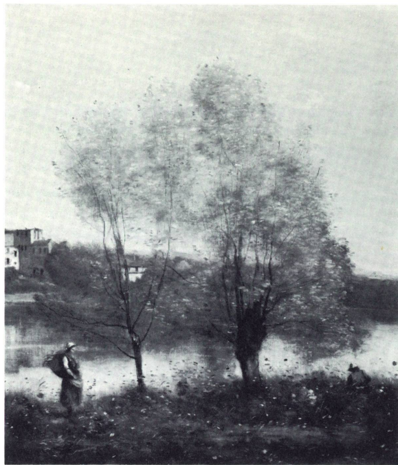
COROT. Ville d'Avray (detail)