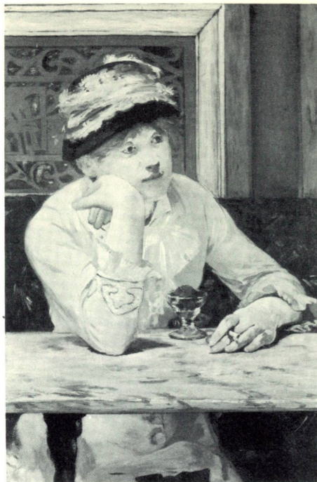
MANET. The Plum