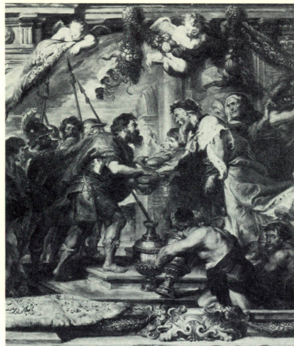
RUBENS. The Meeting of Abraham and Melchizedek (detail)