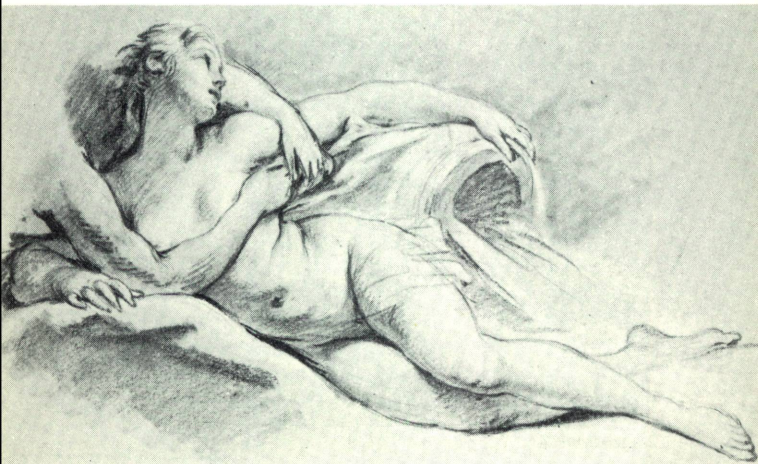
BOUCHER. A Nymph: Study for Apollo and Issé (detail) Lent by The Art Institute of Chicago The Joseph and Helen Regenstein Collection

The exhibition of one hundred drawings by François Boucher continues on view through March 17. Great interest in this exhibition, which reviews the work of the reigning artist of eighteenth-century France, has been shown by both critics and visitors. Paintings by Boucher and porcelains, prints, tapestries, book illustrations and French furniture are displayed in a period room presentation of the French rococo style. A leaflet on the exhibition is available without charge at the catalog desk. Written by the Gallery's Education Department, this leaflet contains an informative article on the rococo style, Boucher's numerous techniques, and his virtuosity as a draftsman. A fully illustrated catalog, with entries on each drawing and an introductory essay, is available both at the exhibition and in the Publications Rooms.