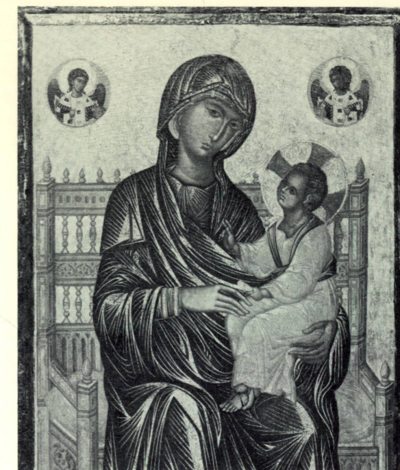
BYZANTINE, XIII CENTURY. Enthroned Madonna and Child (detail)