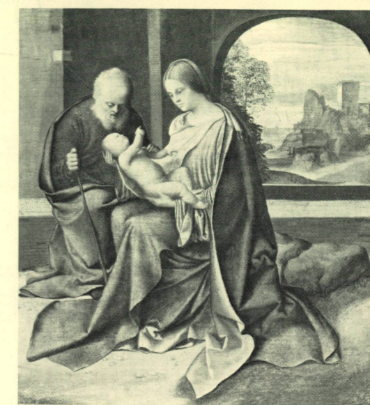
GIORGIONE. The Holy Family (detail)

MONDAY, December 20 through SUNDAY, December 26