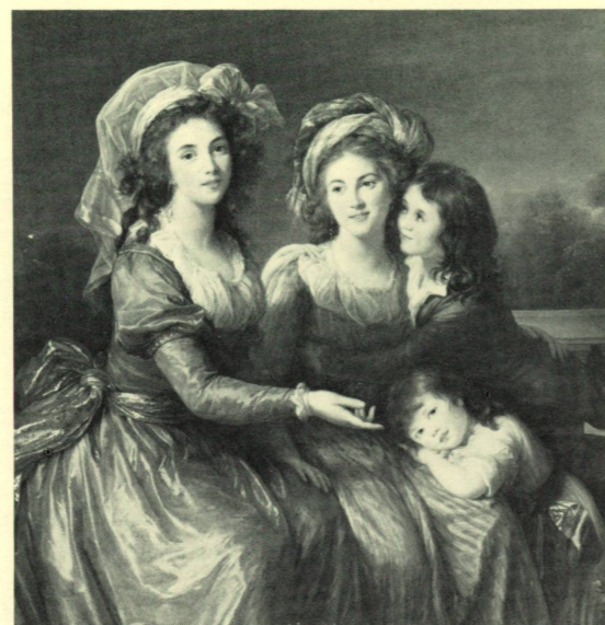
VIGÉE-LEBRUN. The Marquise de Pezè and the Marquise de Rouget and Her Two Children (detail)

MONDAY, December 6 through SUNDAY, December 12