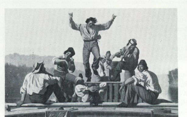
The Jolly Flatboatmen. (detail) Bingham Collection of the Honorable Claiborne Pell

April 8 marks the beginning of the Gallery's 36th annual American Music Festival, a series of Sunday evening concerts devoted entirely to works of American composers dating from colonial times to the present day. The concerts will be given in the East Garden Court, West Building, at 7:00 p.m. through May 27. They will include world premieres and first Washington performances.