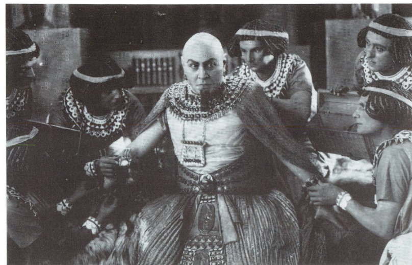
The Loves of Pharaoh , Ernst Lubitsch

New gallery guides in English for seventeenth-century Dutch paintings (Galleries 47, 50, 51) and eighteenth-century French art (Galleries 53, 54, 55), are now available. Guides for Cézanne and Gauguin will be in place when Galleries 80 and 82 reopen later in the month. The illustrated laminated guides are part of a new program to