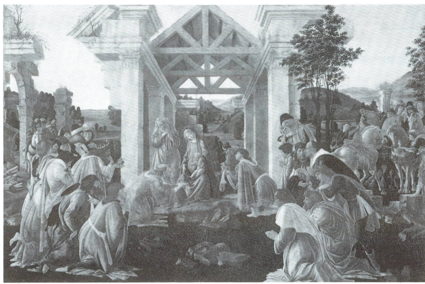
Botticelli, The Adoration of the Magi , early 1460s, National Gallery of Art, Andrew W. Mellon Collection

12:00 Gallery Talk: Pentimenti: Artists' Revisions of Their Work 1:00 Film: Brothers 2:00 Gallery Talk: "The Adoration of the Magi" by Botticelli 4:00 Sunday Lecture: Kollwitz in Context: The Formative Years