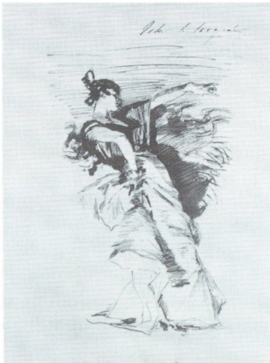
John Singer Sargent, Sketch of the Dancer, after El Jaleo , 1882, Private Collection

Post-1945 European and American art is shown in 14 rooms on the concourse level, comprising survey