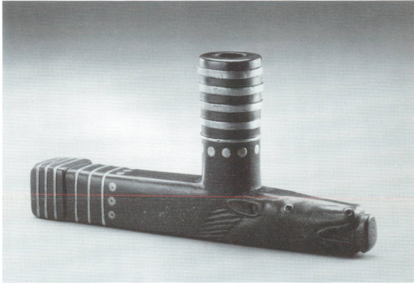
South Dakota (?), Sioux Pipe Bowl , c. 1870, The Detroit Institute of Arts, Museum Purchase with funds from the state of Michigan, the city of Detroit, and the Founders Society Detroit Institute of Arts

The exhibition was organized by the Detroit Institute of Arts in association with the National Gallery of Art and the Buffalo Bill Historical Center, Cody, Wyoming, with support from the National Endowment for the Humanities, the city of Detroit, the state of Michigan, and the Founders