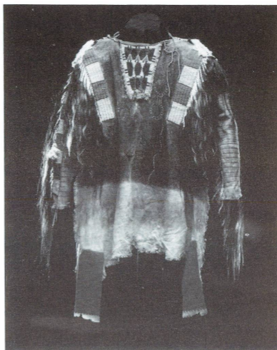
Montana, Northern Cheyenne Man's Shirt , c. 1860, Detroit Institute of Arts, Founders Society Purchase with funds from the Flint Ink Corporation