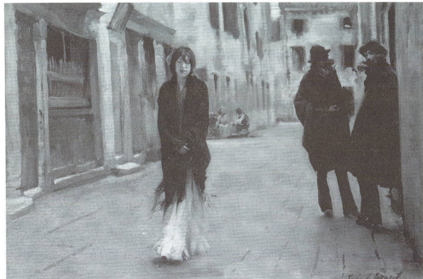
John Singer Sargent, Street in Venice (detail), 1882, National Gallery of Art, Gift of the Avalon Foundation

JUNE 28 Charles Rosen, pianist Works by Beethoven: The three last piano sonatas Final concert of the season. Concerts will resume on October 4, with a concert by the National Gallery Orchestra.