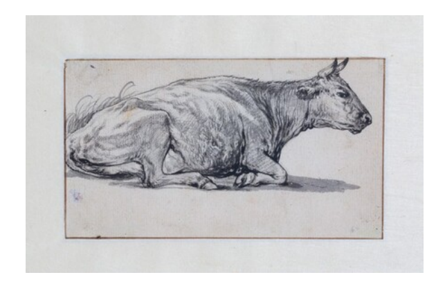
fig. 1 Aelbert Cuyp, A Cow Lying Down , early 1650s, black chalk, gray wash, private collection, The Netherlands