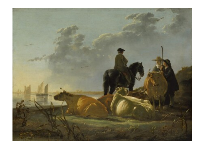
fig. 2 Aelbert Cuyp, Peasants and Cattle by the River Merwede, c. 1658–1660, oil on panel, National Gallery, London, Bequeathed by John Staniforth Beckett, 1889, NG1289.