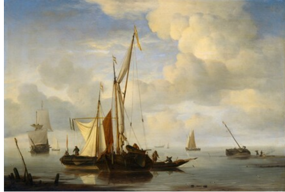
fig. 2 Willem van de Velde the Younger, Ships on a Calm Sea , early 1660s, oil on panel, private collection