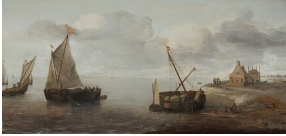
fig. 1 Jan Porcellis, Fishers on the Shore , c. 1622–1625, oil on panel, Hessisches Landesmuseum, Darmstadt.