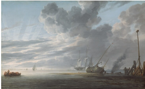
Simon de Vlieger Dutch, 1600/1601 - 1653