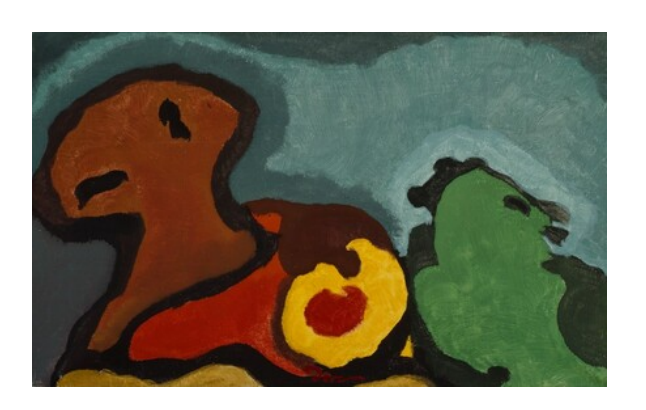
fig. 1 Arthur Dove, Autumn, 1935, tempera on canvas