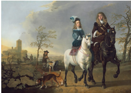
Aelbert Cuyp Dutch, 1620 - 1691