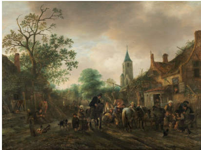
Isack van Ostade Dutch, 1621 - 1649