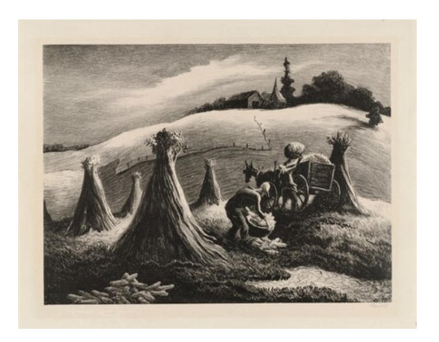
fig. 2 Thomas Hart Benton, Loading Corn , 1945, lithograph, The Museum of Modern Art, New York. Gift of W. J. Cole.