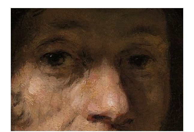
fig. 5 Detail of eyes, Rembrandt van Rijn, Portrait of a Gentleman with a Tall Hat and Gloves , c. 1656/1658, oil on canvas transferred to canvas, National Gallery of Art, Washington, Widener Collection