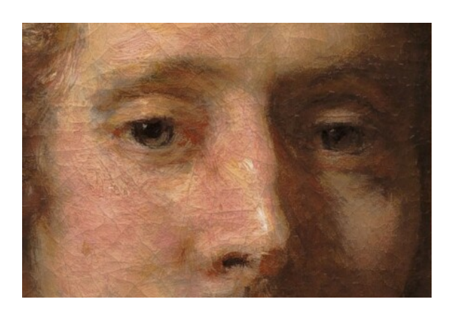
fig. 6 Detail of eyes, Rembrandt van Rijn, A Young Man Seated at a Table (possibly Govaert Flinck), c. 1660, oil on canvas, National Gallery of Art, Washington, Andrew W. Mellon Collection