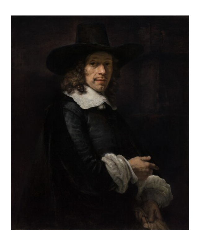
fig. 1 Rembrandt van Rijn, Portrait of a Gentleman with a Tall Hat and Gloves , c. 1656/1658, oil on canvas transferred to canvas, National Gallery of Art, Washington, Widener Collection