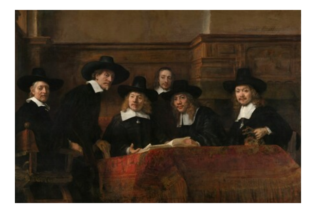
fig. 1 Rembrandt van Rijn, Syndics of the Cloth Drapers' Guild, 1662, oil on canvas, Rijksmuseum, Amsterdam.