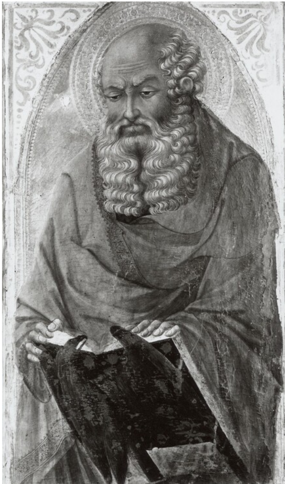
fig. 3 Bartolomeo Bulgarini, Saint John the Evangelist , c. 1335/1340, tempera on panel, Museo Nazionale di Villa Guinigi, Lucca