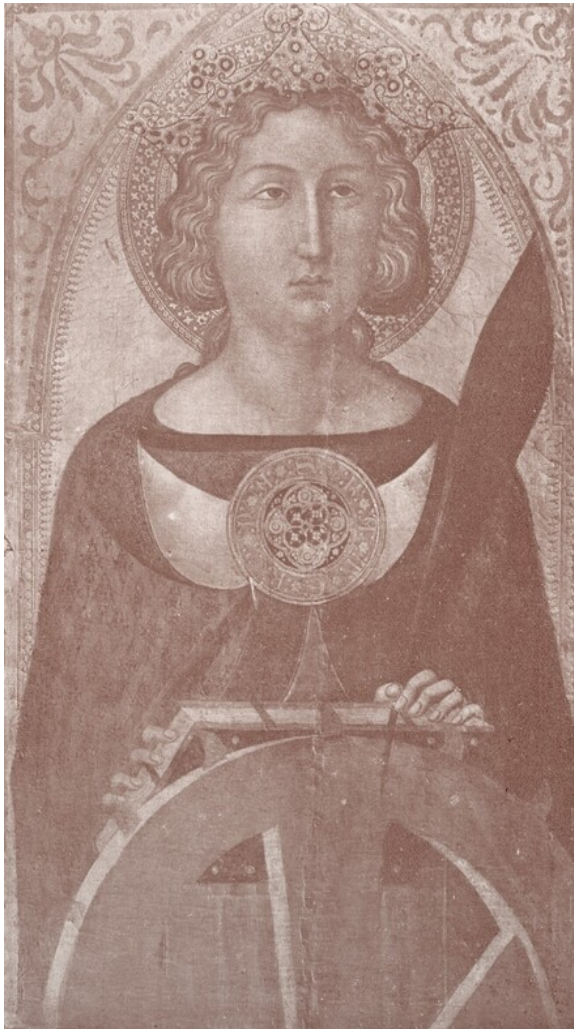
fig. 1 Archival photograph, c. 1905, before restoration, Bartolomeo Bulgarini, Saint Catherine of Alexandria , c. 1335/1340, tempera on panel, National Gallery of Art, Washington, Samuel H. Kress Collection.