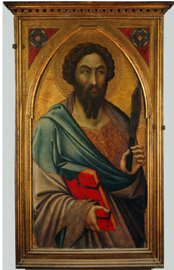
fig. 4 Bartolomeo Bulgarini, Saint Bartholomew , c. 1335/1340, tempera on panel, Pinacoteca Capitolina, Rome.