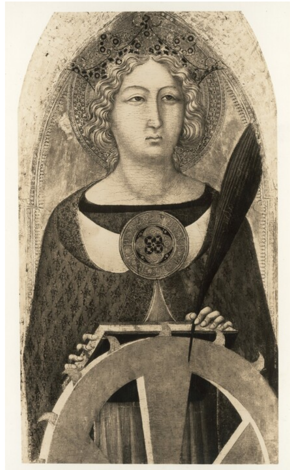
fig. 2 Archival photograph, c. 1930, Bartolomeo Bulgarini, Saint Catherine of Alexandria , c. 1335/1340, tempera on panel, National Gallery of Art, Washington, Samuel H. Kress Collection.