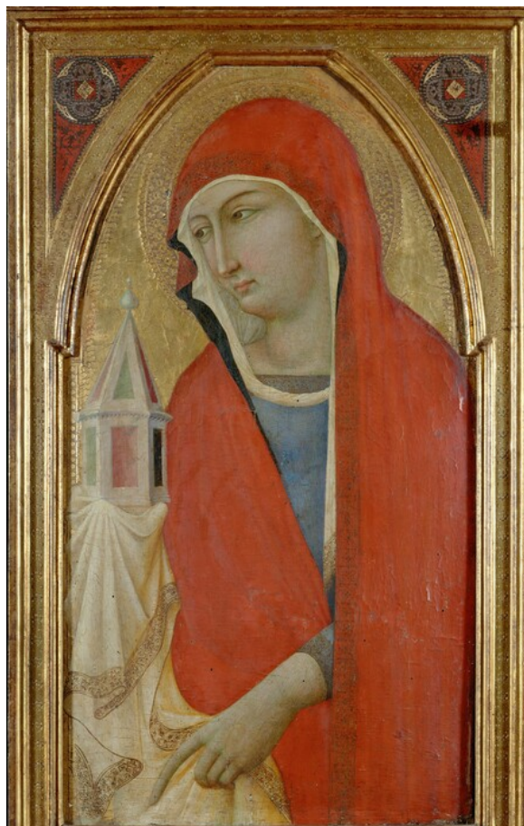
fig. 5 Bartolomeo Bulgarini, Saint Mary Magdalene , c. 1335/1340, tempera on panel, Pinacoteca Capitolina, Rome.