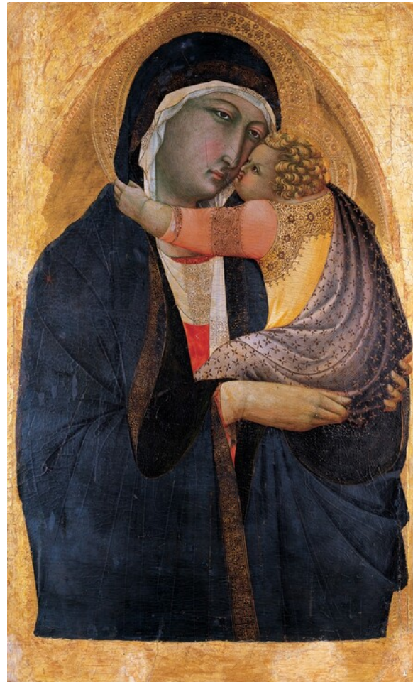
fig. 2 Bartolomeo Bulgarini, Madonna and Child , c. 1335/1340, tempera on panel, Museo Nazionale di Villa Guinigi, Lucca.