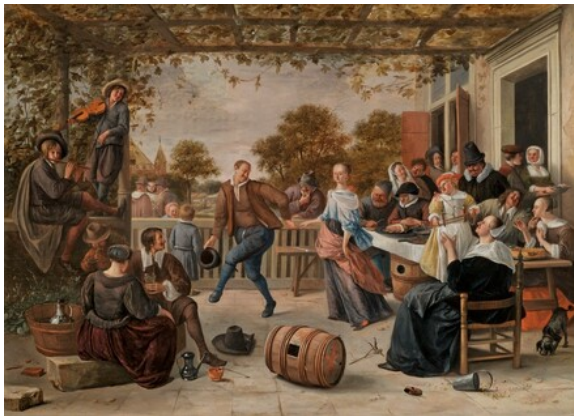
fig. 3 Jan Steen, A Terrace with a Couple Dancing to a Pipe and Fiddle, Peasants Eating and Merrymaking Behind , c. 1663, private collection (Sotheby's, London, 4 July 2007, lot 36) . Photo courtesy of Sotheby's Picture Library