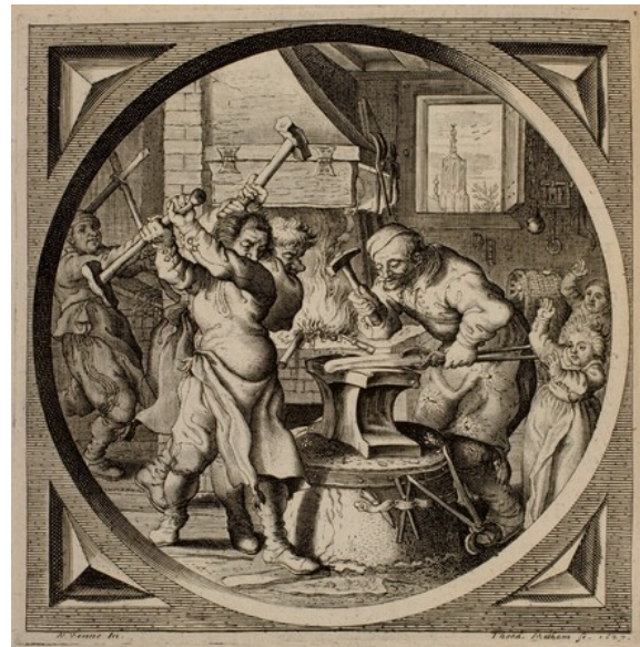
fig. 6 Jacob Cats, Spiegel van den Ouden ende Nieuwen Tijd , The Hague, 1611