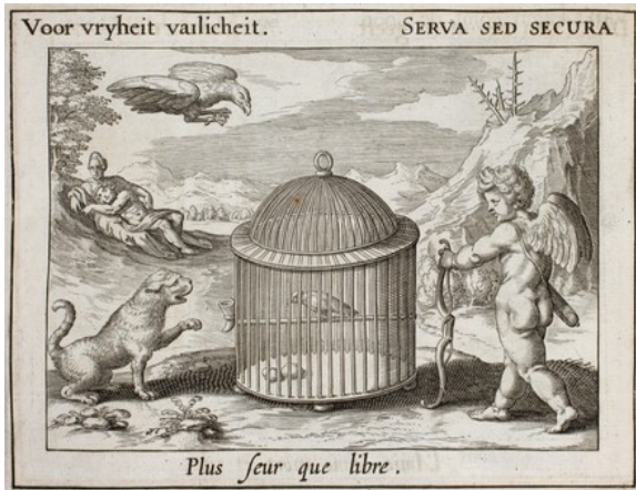
fig. 5 P. C. Hooft, “Voor vryheyt vaylicheyt,” emblem from Emblemata Amatoria , Amsterdam, 1611