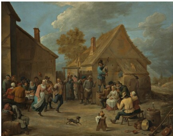
fig. 7 David Teniers the Younger, The Village Feast, 1651, oil on copper, Museum Boijmans Van Beuningen, Rotterdam.