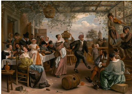
Jan Steen Dutch, 1625/1626 - 1679