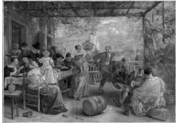
fig. 2 Infrared reflectogram, Jan Steen, The Dancing Couple , 1663, oil on canvas, National Gallery of Art, Washington, Widener Collection