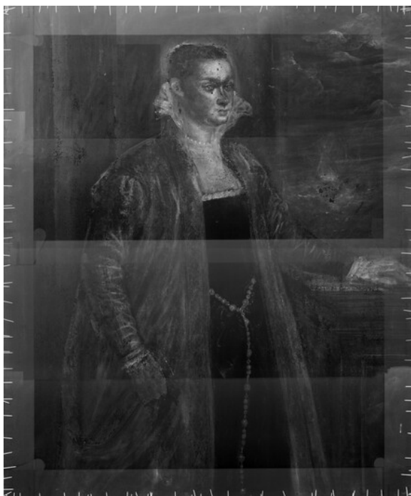
fig. 1 X-radiograph, Assistant of Titian, possibly begun by Gian Paolo Pace, Emilia di Spilimbergo , c. 1560, oil on canvas, National Gallery of Art, Washington, Widener Collection