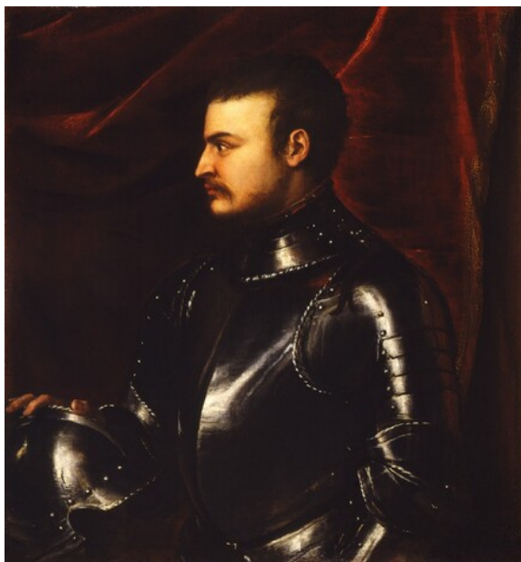
fig. 1 Workshop of Titian (Gian Paolo Pace), Giovanni delle Bande Nere , c. 1545, oil on canvas, Uffizi Gallery, Florence. Su concessione del Ministero dei beni e delle attività culturali e del turismo