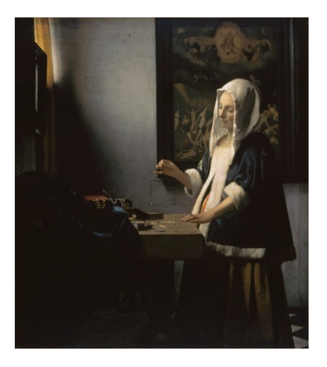
fig. 3 Before the 1994 conservation treatment, Johannes Vermeer, Woman Holding a Balance , c. 1664, oil on canvas, National Gallery of Art, Washington, Widener Collection