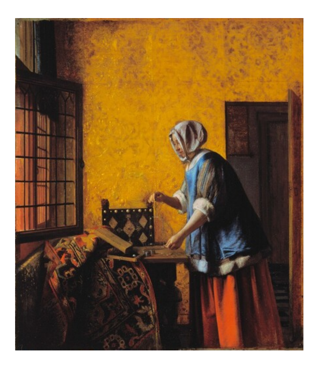
fig. 4 Pieter de Hooch, A Woman Weighing Gold , mid-1660s, oil on canvas, Staatliche Museen zu Berlin, Preussischer Kulturbesitz, Gemäldegalerie.

fig. 3 Before the 1994 conservation treatment, Johannes Vermeer, Woman Holding a Balance , c. 1664, oil on canvas, National Gallery of Art, Washington, Widener Collection