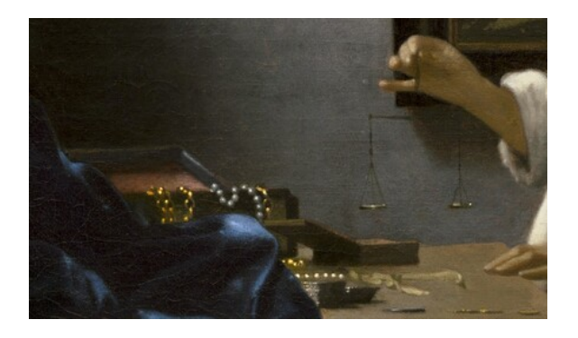
fig. 1 Detail, Johannes Vermeer, Woman Holding a Balance , c. 1664, oil on canvas, National Gallery of Art, Washington, Widener Collection