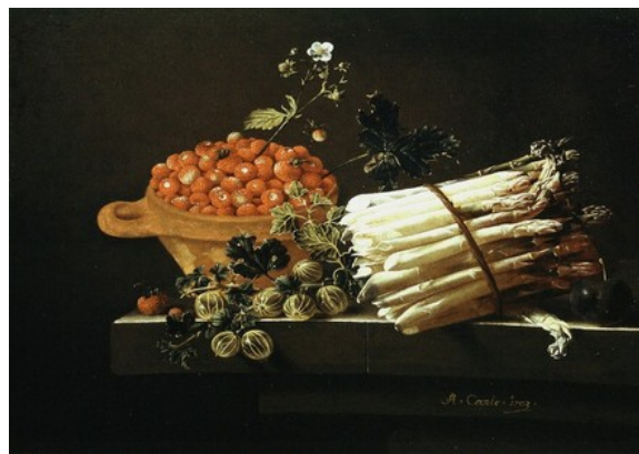
fig. 2 Adriaen Coorte, Still Life with a Bowl of Strawberries and Gooseberries , 1696, oil on canvas, private collection