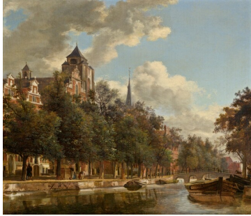
Jan van der Heyden Dutch, 1637 - 1712