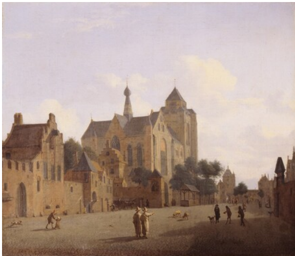
fig. 1 Jan van der Heyden, The Church at Veere , oil on canvas, Royal Picture Gallery, Mauritshuis, The Hague