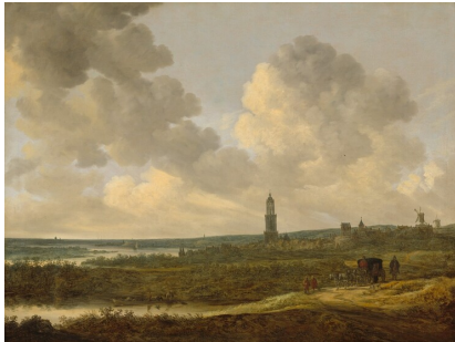
Jan van Goyen Dutch, 1596 - 1656