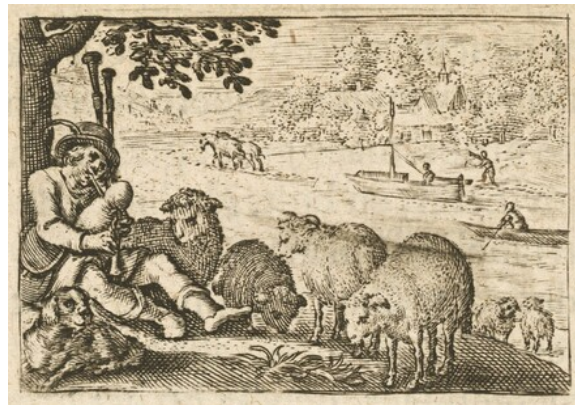
fig. 2 Anonymous, Cordion Playing a Bagpipe , engraving from Daniel Heinsius, "Pastorael," in Heinsius, Nederduytsche poemata , Amsterdam, 1616