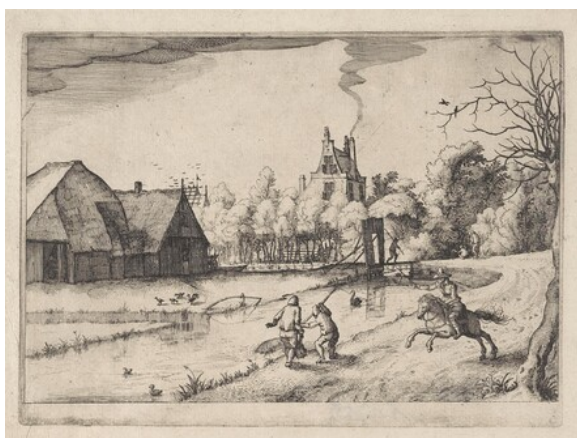
fig. 5 Claes Jan Visscher, Country House and Orchard of Jan Deyman , 1608–1609, etching, Rijksprentenkabinet, Rijksmuseum, Amsterdam, inv. nr.: RP-P-1888-A-12755