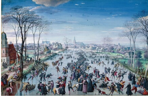
fig. 1 Hans Bol, Enjoyment on the Frozen Amstel , 1589, gouache, Miniaturenkabinett, Munich Residenzschlösser, Gärten und Seennz Museum, inv. nr.: ResMü.G 898 (Bucheit 14)