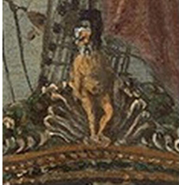
fig. 6 Detail, the carved figure on the stern of the Huis te Swieten, Reinier Nooms, called Zeeman, Amsterdam Harbor Scene , c. 1654/1655, oil on canvas, National Gallery of Art, Washington, The Lee and Juliet Folger Fund