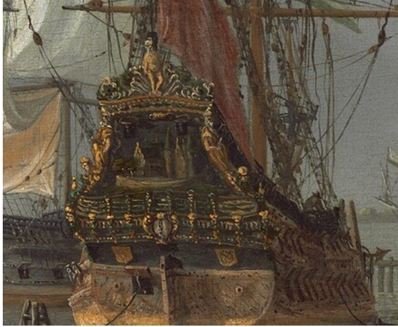
fig. 3 Detail, the stern of warship Huis te Swieten, Reinier Nooms, called Zeeman, Amsterdam Harbor Scene , c. 1654/1655, oil on canvas, National Gallery of Art, Washington, The Lee and Juliet Folger Fund