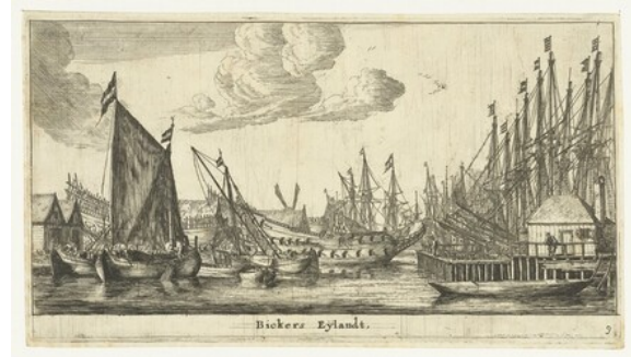
fig. 8 Reinier Nooms, Bicker's Eylandt engraving from Verscheide Schepen en Gesichten van Amstelredam , Amsterdam, 1654, Rijksmuseum, Amsterdam, inv. RP-P-OB-20.527