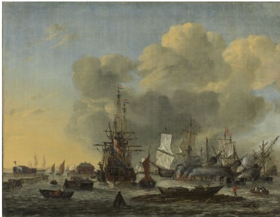
fig. 1 Reinier Nooms, Caulking ships at the Bothuisje on the Y at Amsterdam , 1650–1668, oil on canvas, Rijksmuseum, Amsterdam, inv. SK-A-759