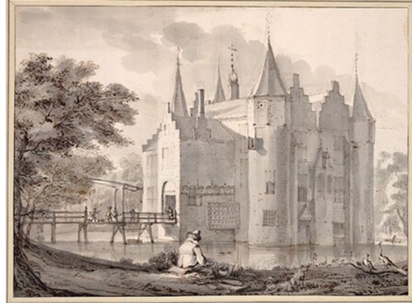
fig. 4 Roelant Roghman, Schloss Swieten , 1646–1647, pen in brown and brush in gray, Graphische Sammlung Albertina, Vienna, inv. 15130