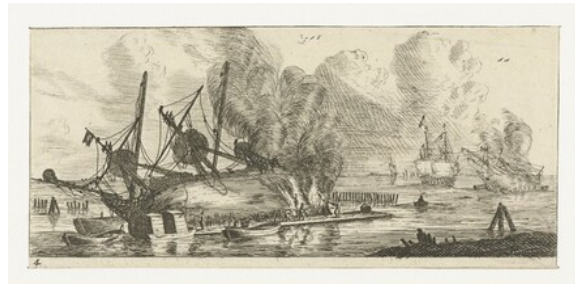
fig. 2 Reinier Nooms, Two Ships Careened for Caulking the Hulls , engraving from Diverse inschepingen en dergelijken (Amsterdam, 1651–1652), fol. 4, Rijksmuseum, Amsterdam, inv. RP-P-OB-20.588