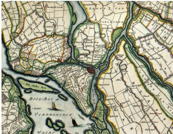
fig. 3 Detail, Nicolaas Visscher II, Hollandiae Pars Meridionalior, vulgo Zuid-Holland (Atlas van der Hagen) , Amsterdam, before 1680, copper engraving, Koninklijke Bibliotheek, The Hague