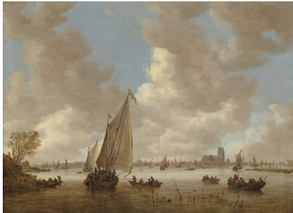
Jan van Goyen Dutch, 1596 - 1656