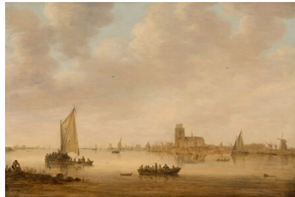
fig. 2 Jan van Goyen, View of Dordrecht from the Dordtse Kil , 1644, oil on panel, National Gallery of Art, Washington, Ailsa Mellon Bruce Fund