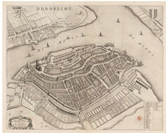
fig. 4 Joan Blaeu, Plan of Dordrecht , 1652, etching, Rijksmuseum, Amsterdam, inv. RP-P-AO-14-33-1