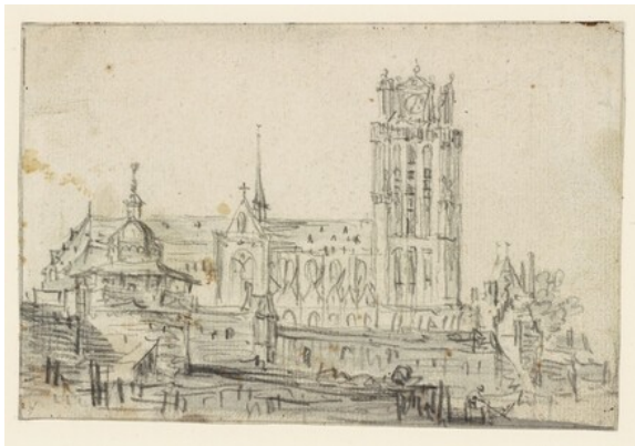
fig. 1 Jan van Goyen, View of the Grote Kerk, in Dordrecht , c. 1648, black chalk, pen, and black ink, Museum Boijmans van Beuningen, Rotterdam, JvG 7