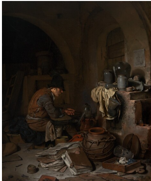
Cornelis Bega Dutch, 1631/1632 - 1664