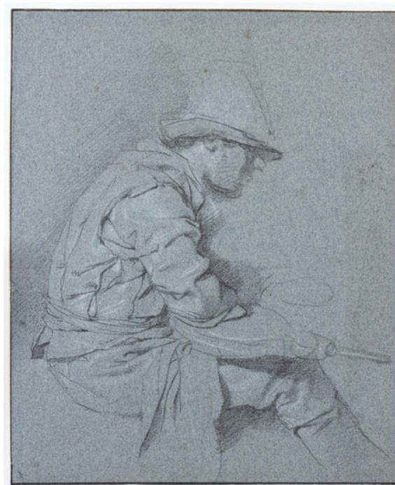
fig. 6 Cornelis Bega, Study of an Alchemist , c. 1663, black chalk with white heightening on blue paper, Museum Mayer van den Bergh, Antwerp, inv. no. MMB.1049.