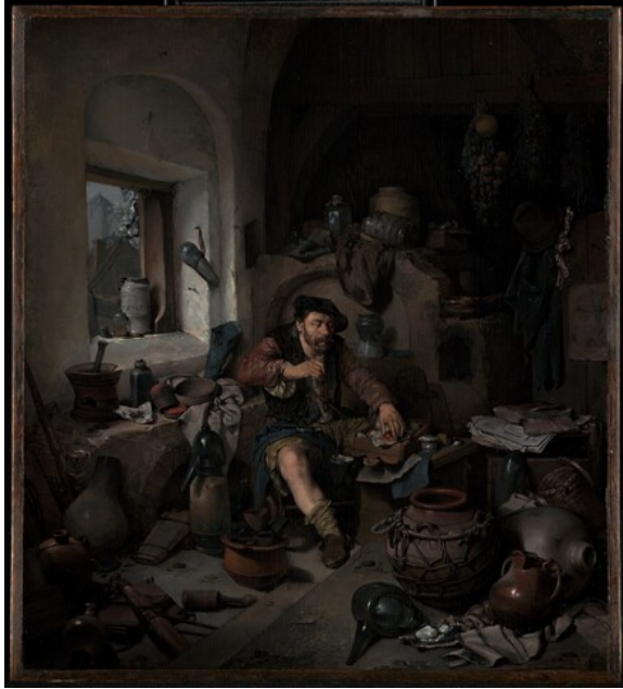
fig. 1 Cornelis Bega, The Alchemist , 1663, oil on panel, The J. Paul Getty Museum, Los Angeles, inv. no. 84.PB.56.