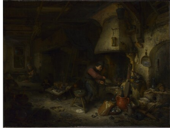
fig. 2 Adriaen van Ostade, The Alchemist , 1661, oil on oak, National Gallery, London.