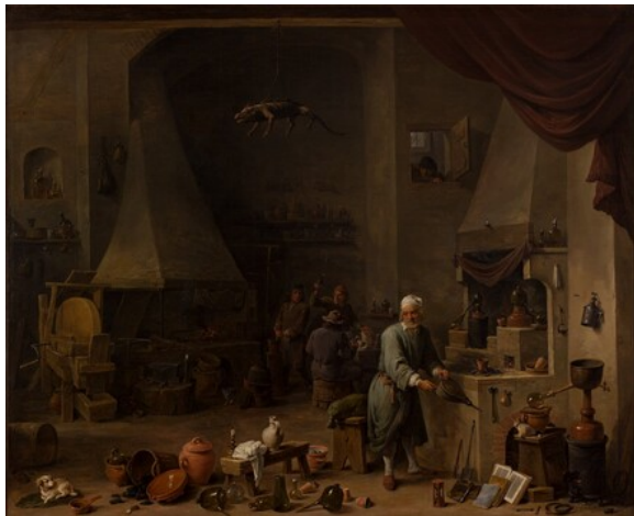
fig. 5 David Teniers the Younger, Interior of a Laboratory with an Alchemist , c. 1650, oil on canvas, Chemical Heritage Foundation Collections, inv. FA. 00-03-23.