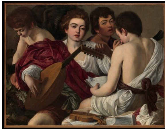
fig. 2 Michelangelo Merisi da Caravaggio, The Musicians , c. 1595, oil on canvas, Metropolitan Museum of Art, New York, Rogers Fund, 1952 (52.81)