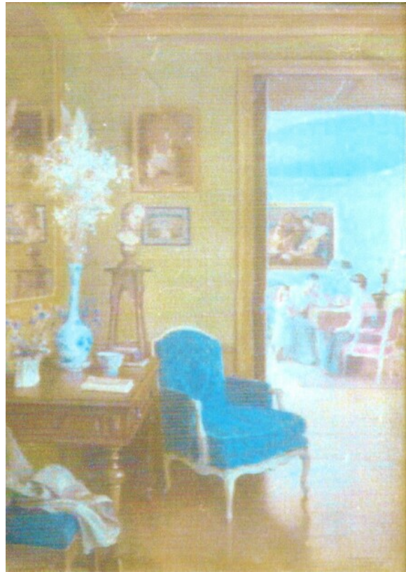
fig. 6 Etienne Azambre, Interior of a French Country Estate , c. 1900, watercolor, private collection