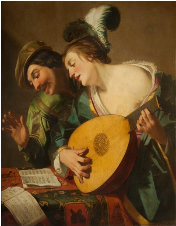
fig. 5 (style of) Hendrick ter Brugghen, The Music Lesson , oil on canvas, The Whitaker (previously Rossendale Museum & Art Gallery), inv. PA-129