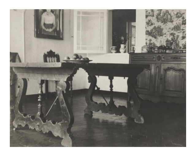
fig. 1 Photo of Patrick Henry Bruce's Paris apartment, c. 1917–1918.