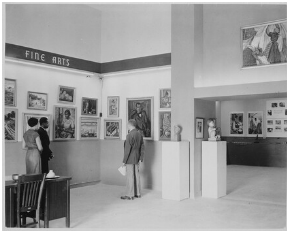
fig. 3 Texas Centennial Exhibit, Hall of Negro Life, 1936 , photograph, US National Archives