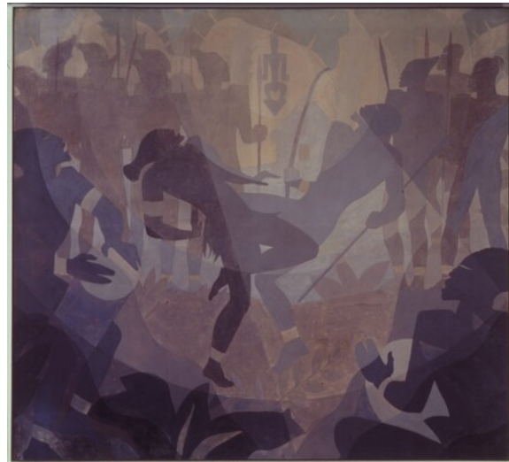
fig. 4 Aaron Douglas, Aspects of Negro Life: The Negro in an African Setting, 1934 , oil on canvas, The New York Public Library, Schomburg Center for Research in Black Culture, Art and Artifacts Division.