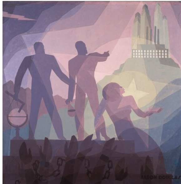
fig. 2 Aaron Douglas, Aspiration , 1936, oil on canvas, The Fine Arts Museums of San Francisco