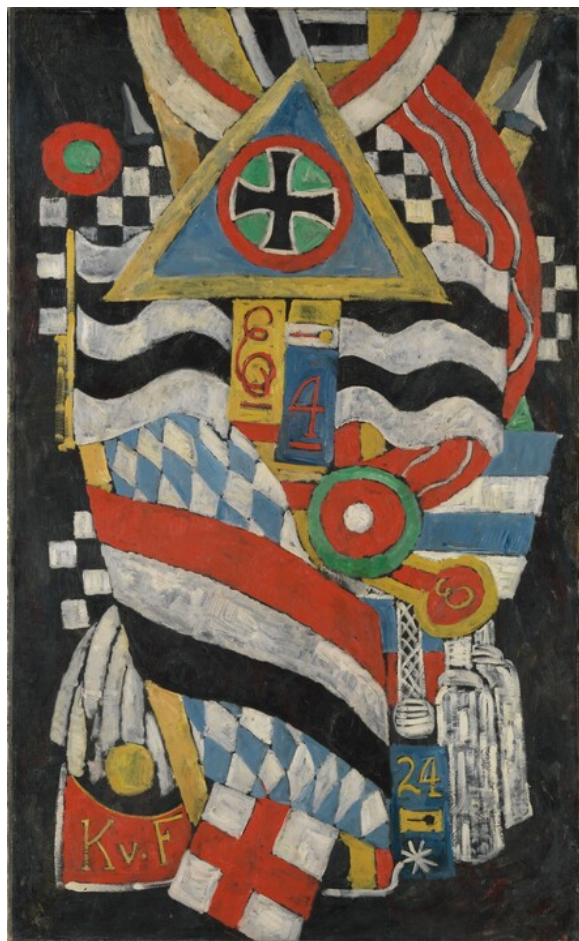
fig. 1 Marsden Hartley, Portrait of a German Officer , 1914, oil on canvas, The Metropolitan Museum of Art, New York, Alfred Stieglitz Collection, 1949