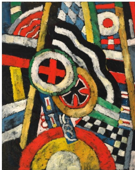
fig. 2 Marsden Hartley, Painting Number 5 , 1914–1915, oil on linen, Whitney Museum of American Art, New York, Gift of an Anonymous Donor 58.65