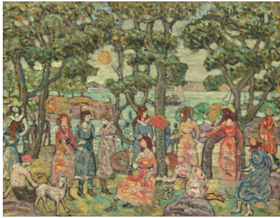
Maurice Prendergast American, 1858 - 1924