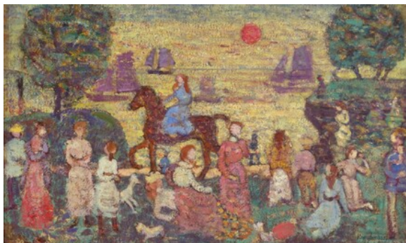
fig. 1 Maurice Prendergast, Sunset and Sea Fog , c. 1918–1923, oil on canvas, Butler Institute of American Art