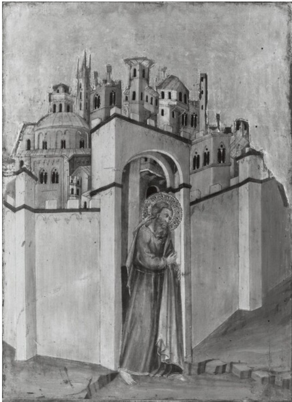
fig. 1 Andrea di Bartolo, Joachim Leaving Jerusalem , c. 1400/1405, tempera on panel, Keresztény Múzeum, Esztergom, Hungary