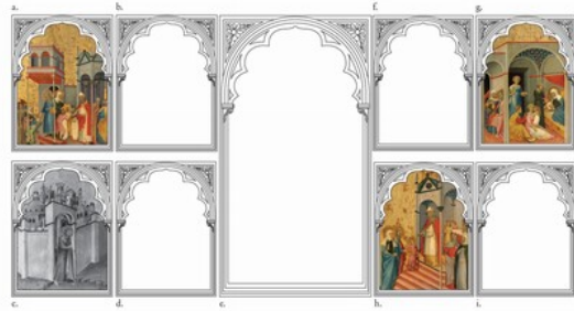
fig. 2 Reconstruction of a dispersed altarpiece by Andrea di Bartolo (color images are NGA objects): a. Joachim and Anna Giving Food to the Poor and Offerings to the Temple ; b. Expulsion of Joachim (?), lost; c. Joachim Leaving Jerusalem (fig. 1); d. Annunciation of the Birth of Mary (?), lost; e. Lost; f. Meeting at Porta Aurea (?), lost; g. The Nativity of the Virgin ; h. The Presentation of the Virgin in the Temple ; i. Marriage of the Virgin (?), lost