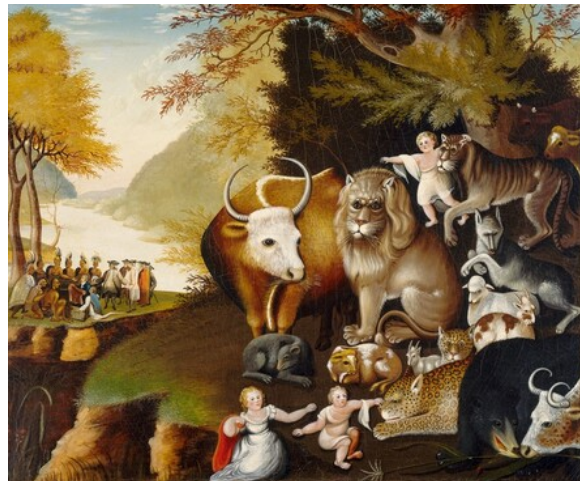
fig. 2 Edward Hicks, Peaceable Kingdom , c. 1834, oil on canvas, National Gallery of Art, Washington, Gift of Edgar William and Bernice Chrysler Garbisch