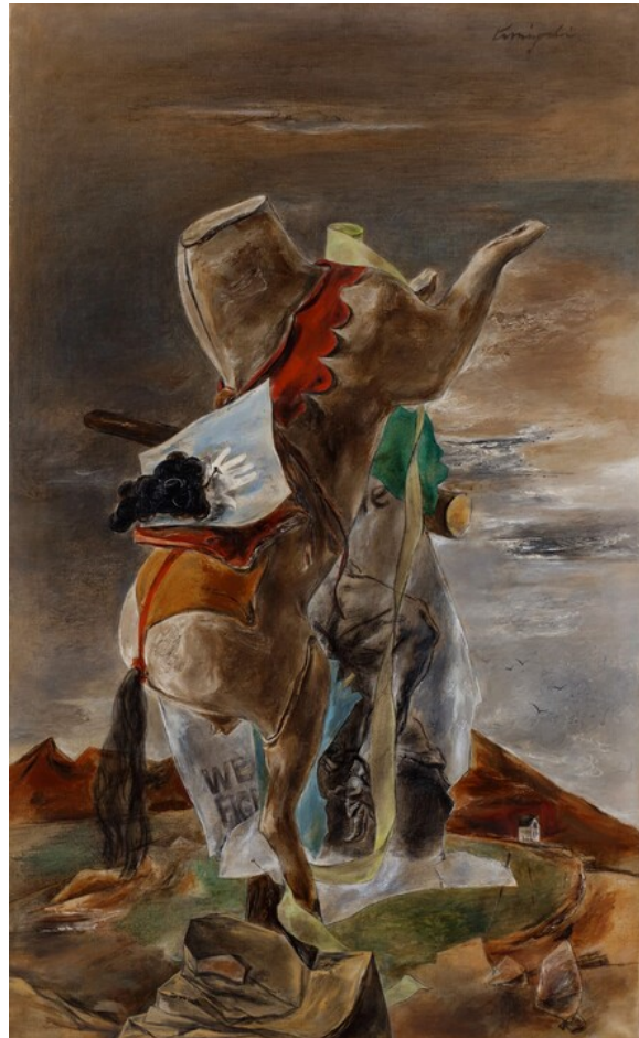
fig. 4 Yasuo Kuniyoshi, Headless Horse Who Wants to Jump , 1945, oil on canvas, Ohara Museum of Art, Kurashiki, Japan