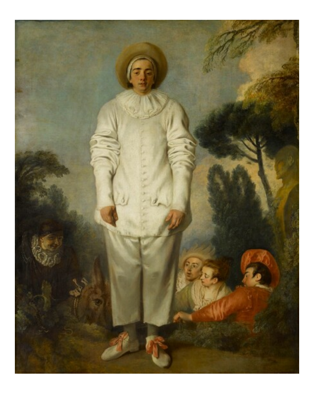
fig. 2 Jean-Antoine Watteau, Pierrot, formerly known as Gilles , c. 1718–1719, oil on canvas, Musée du Louvre, Paris.