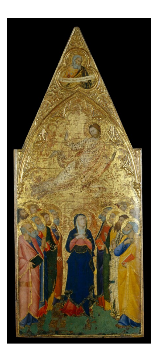
fig. 3 Andrea di Vanni, Ascension , c. 1380s, tempera on panel, The State Hermitage Museum, St. Petersburg, Gift of the heirs of Count G. S. Stroganov, 1911