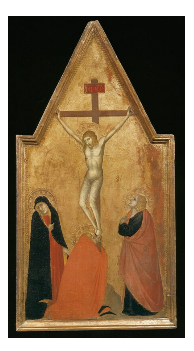
fig. 2 Pietro Lorenzetti, Crucifixion , c. 1325–1326, tempera on panel, Pinacoteca Nazionale, Siena