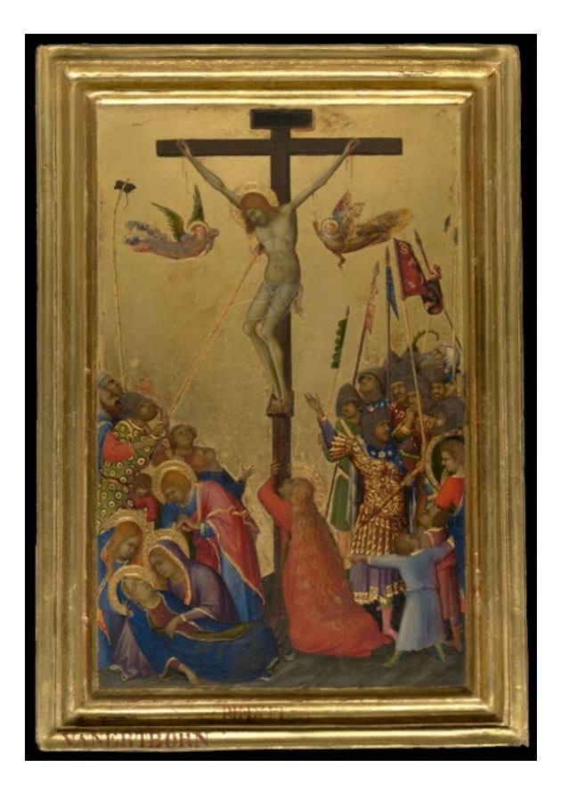
fig. 1 Simone Martini, Crucifixion (from the Orsini Polyptych), c. 1335, tempera on panel, Royal Museum of Fine Arts, Antwerp