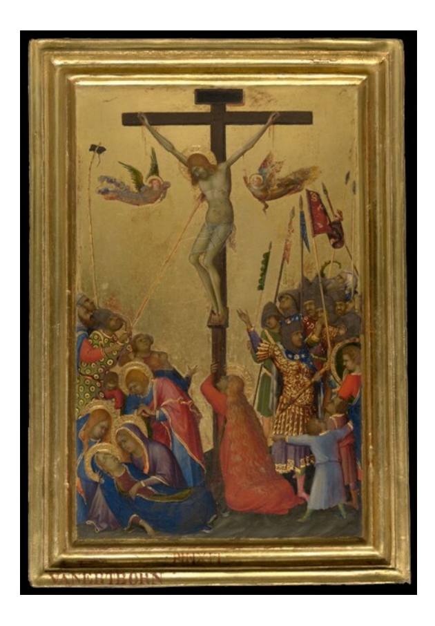
fig. 1 Simone Martini, Crucifixion (from the Orsini Polyptych), c. 1335, tempera on panel, Royal Museum of Fine Arts, Antwerp