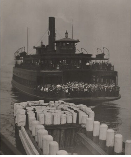
Alfred Stieglitz After Working Hours—The Ferry Boat 1910, printed 1929/1934 gelatin silver print Key Set Number 333 same negative