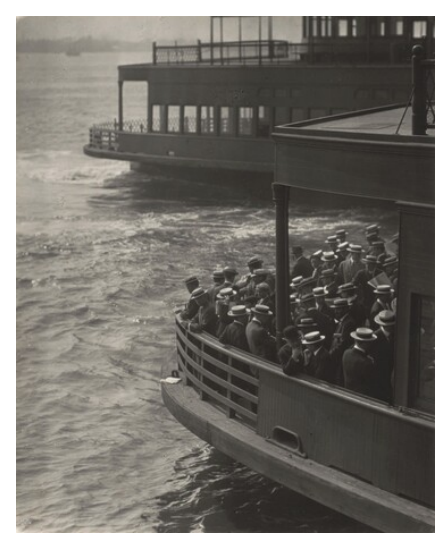
Alfred Stieglitz The Ferry Boat 1910, printed 1929/1932 gelatin silver print Key Set Number 330