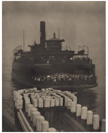
Alfred Stieglitz After Working Hours—The Ferry Boat 1910, printed in or before 1913 photogravure Key Set Number 332 same negative