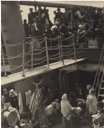
Alfred Stieglitz The Steerage 1907, printed 1911 photogravure Key Set Number 311 same negative