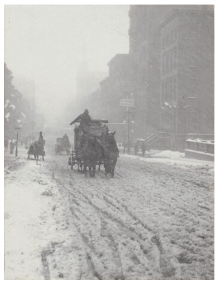
Alfred Stieglitz Winter on Fifth Avenue 1893, printed 1929/1932 gelatin silver print Key Set Number 87 same negative