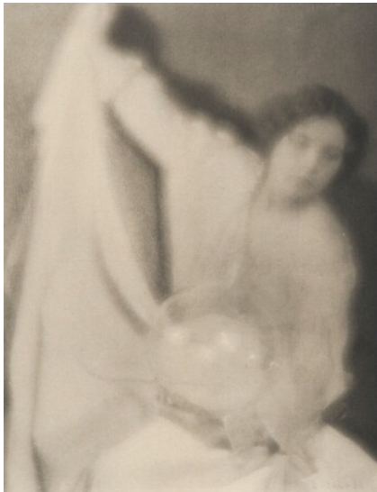
Alfred Stieglitz (editor/publisher) after Various Artists Alfred Stieglitz Clarence H. White Experiment 28 1907, printed 1909 photogravure Key Set Number 325