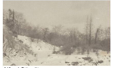
Alfred Stieglitz An Impression, Winter 1894, printed 1895/1896 platinum print Key Set Number 105 same negative