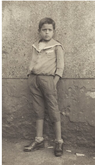
Alfred Stieglitz American, 1864 - 1946