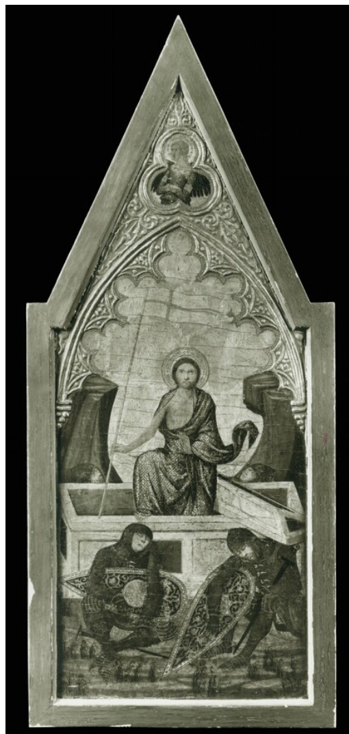
fig. 4 Andrea di Vanni, Resurrection , c. 1380s, tempera on panel, location unknown, formerly in the Ingenheim collection