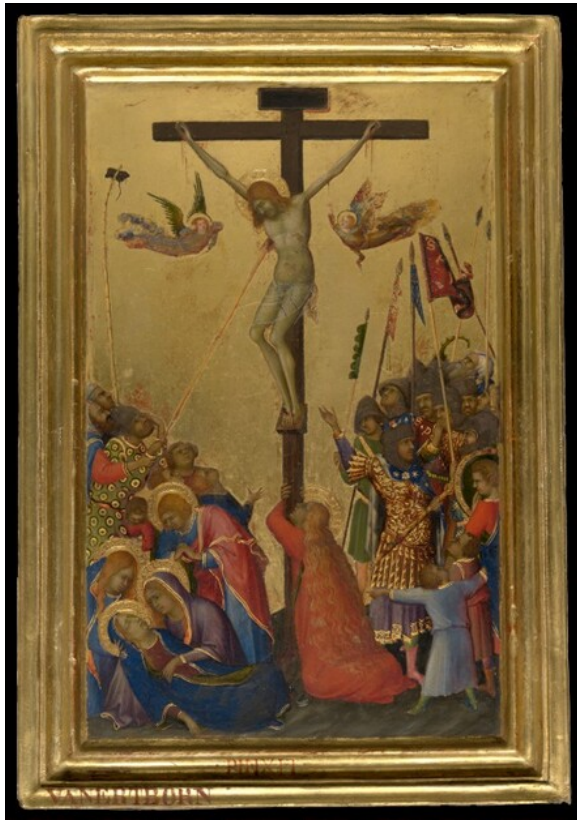
fig. 1 Simone Martini, Crucifixion (from the Orsini Polyptych), c. 1335, tempera on panel, Royal Museum of Fine Arts, Antwerp