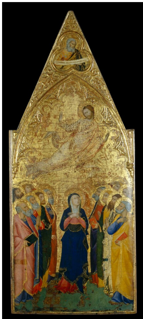
fig. 3 Andrea di Vanni, Ascension , c. 1380s, tempera on panel, The State Hermitage Museum, St. Petersburg, Gift of the heirs of Count G. S. Stroganov, 1911