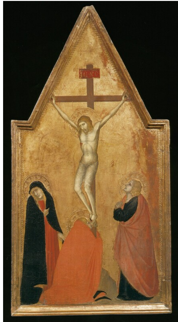
fig. 2 Pietro Lorenzetti, Crucifixion , c. 1325–1326, tempera on panel, Pinacoteca Nazionale, Siena