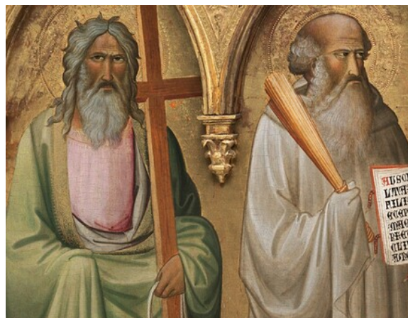
fig. 2 Detail of Saint Andrew (left), Agnolo Gaddi, Madonna and Child with Saints Andrew, Benedict, Bernard, and Catherine of Alexandria with Angels , shortly before 1387, tempera on poplar, National Gallery of Art, Washington, Samuel H. Kress Collection