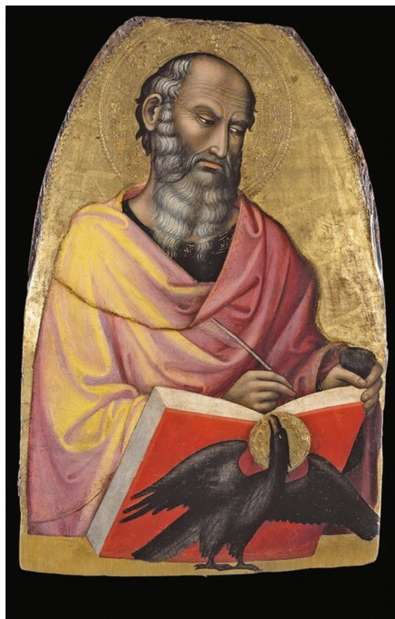
fig. 2 Martino di Bartolomeo, Saint John the Evangelist, 1425–1426, tempera on panel, private collection.