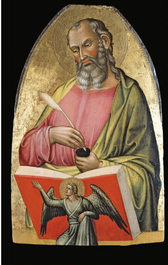
fig. 3 Martino di Bartolomeo, Saint Matthew, 1425–1426, tempera on panel, private collection.