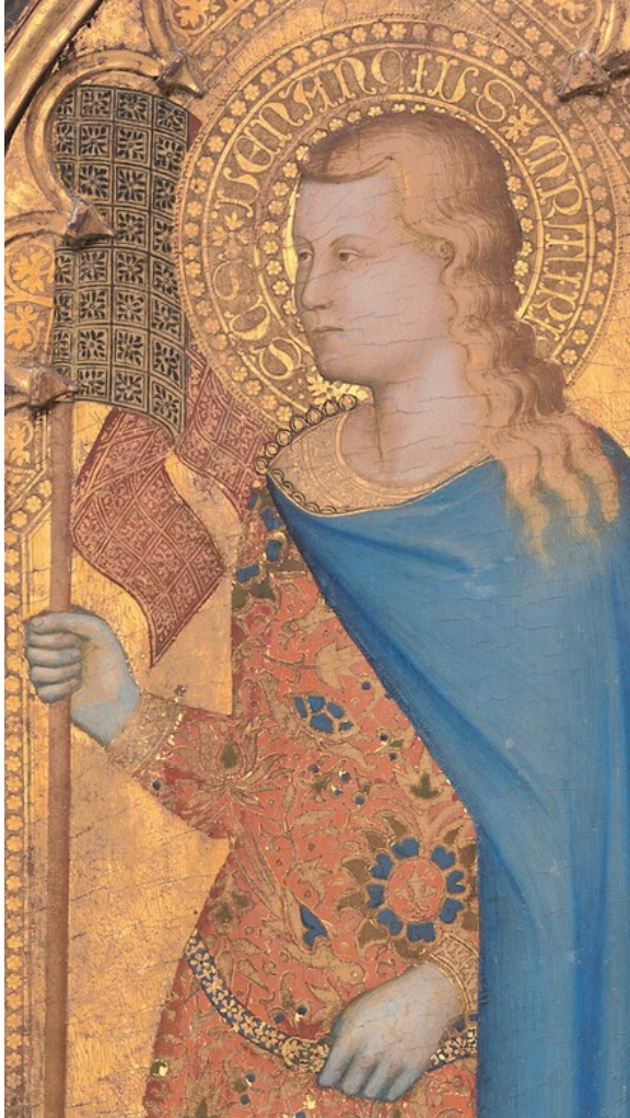
fig. 3 Detail of Saint Venantius (right panel), Puccio di Simone and Allegretto Nuzi, Madonna and Child Enthroned with Saints and Angels , 1354, tempera on panel, National Gallery of Art, Washington, Andrew W. Mellon Collection