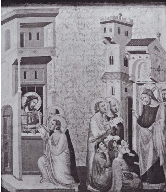
fig. 5 Giovanni Baronzio, The Baptist Sends His Disciples to Christ , c. 1335, tempera on panel, now lost, formerly in the Street collection, Bath