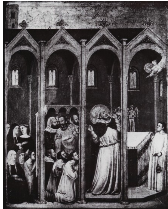
fig. 2 Giovanni Baronzio, Annunciation of the Birth of the Baptist , c. 1335, tempera on panel, now lost, formerly in the Street collection, Bath