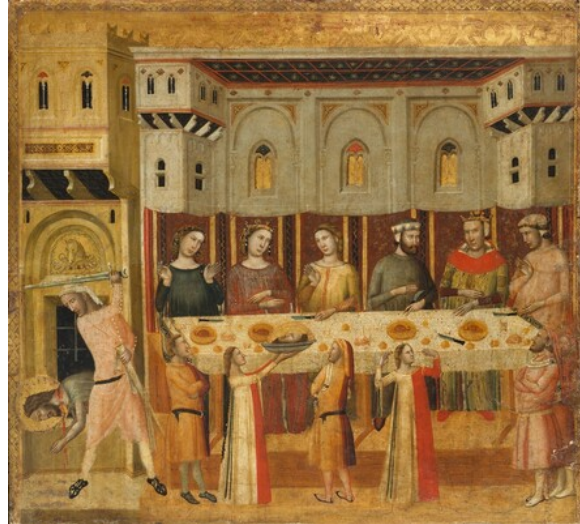
fig. 6 Giovanni Baronzio, Feast of Herod , c. 1335, tempera on panel, The Metropolitan Museum of Art, New York, Robert Lehman Collection