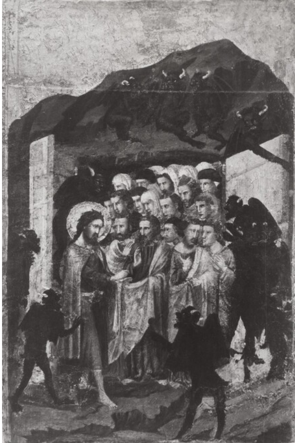
fig. 7 Giovanni Baronzio, The Baptist's Descent into Limbo , c. 1335, tempera on panel, now lost, formerly in the Charles Loeser collection, Florence