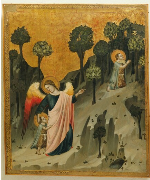
fig. 3 Giovanni Baronzio, Young Baptist Led by an Angel into the Wilderness , c. 1335, tempera on panel, Pinacoteca Vaticana.