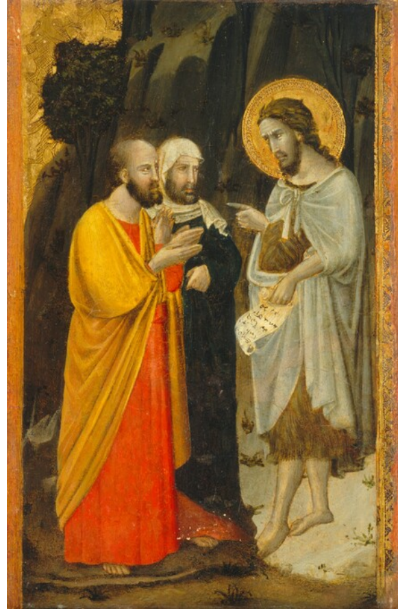
fig. 4 Giovanni Baronzio, The Baptist Interrogated by the Pharisees , c. 1335, wood transferred to Masonite, Seattle Art Museum, Samuel H. Kress Collection.