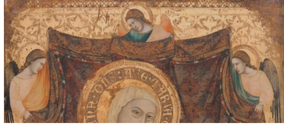
fig. 8 Detail of upper section, Giovanni Baronzio, Madonna and Child with Five Angels , c. 1335, tempera on panel, National Gallery of Art, Washington, Samuel H. Kress Collection