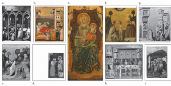
fig. 1 Reconstruction of a dispersed altarpiece by Giovanni Baronzio as proposed by Keith Christiansen (color images are NGA objects): a. Annunciation of the Birth of the Baptist (fig. 2); b. The Birth, Naming, and Circumcision of Saint John the Baptist ; c. Young Baptist Led by an Angel into the Wilderness (fig. 3); d. The Baptist Interrogated by the Pharisees (fig. 4); e. Madonna and Child with Five Angels ; f. The Baptism of Christ ; g. The Baptist Sends His Disciples to Christ (fig. 5); h. Feast of Herod (fig. 6); i. The Baptist's Descent into Limbo (fig. 7)