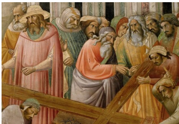
fig. 3 Detail of spectators, Agnolo Gaddi, The Making of the Cross , 1385–1390, fresco, Cappella Maggiore, Santa Croce, Florence.