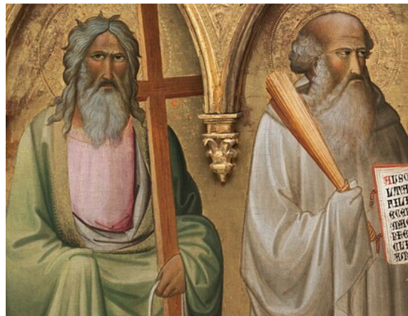
fig. 2 Detail of Saint Andrew (left), Agnolo Gaddi, Madonna and Child with Saints Andrew, Benedict, Bernard, and Catherine of Alexandria with Angels , shortly before 1387, tempera on poplar, National Gallery of Art, Washington, Samuel H. Kress Collection