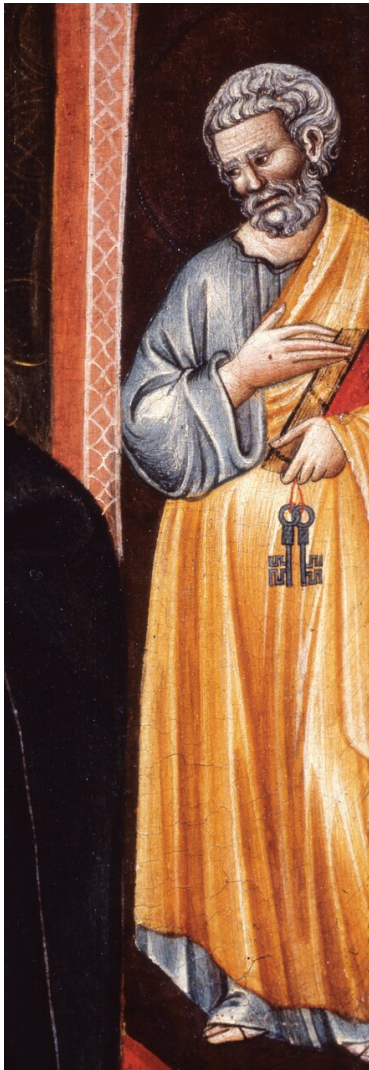
fig. 3 Detail of Saint Peter, Grifo di Tancredi, San Gaggio altarpiece, c. 1300, tempera on panel, Galleria dell'Accademia, Florence