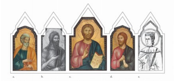
fig. 1 Reconstruction of a dispersed polyptych by Grifo di Tancredi (color images are NGA objects): a. Saint Peter ; b. Saint John the Baptist (fig. 2); c. Christ Blessing ; d. Saint James Major ; e. After Grifo di Tancredi, line drawing of a lost image of Saint Ursula