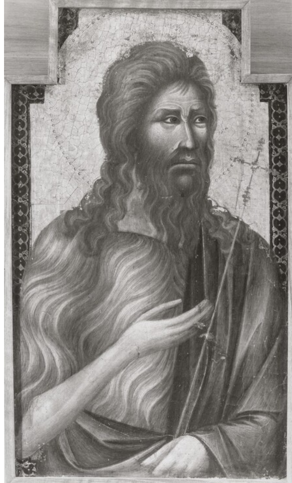
fig. 2 Grifo di Tancredi, Saint John the Baptist , c. 1310, tempera on panel, Musée des Beaux-Arts, Chambéry