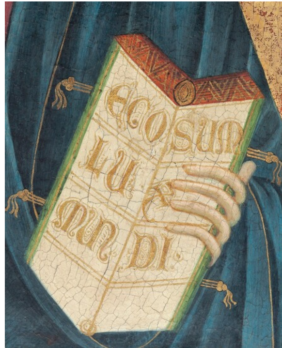
fig. 4 Detail, Grifo di Tancredi, Christ Blessing , c. 1310, tempera on poplar, National Gallery of Art, Washington, Andrew W. Mellon Collection