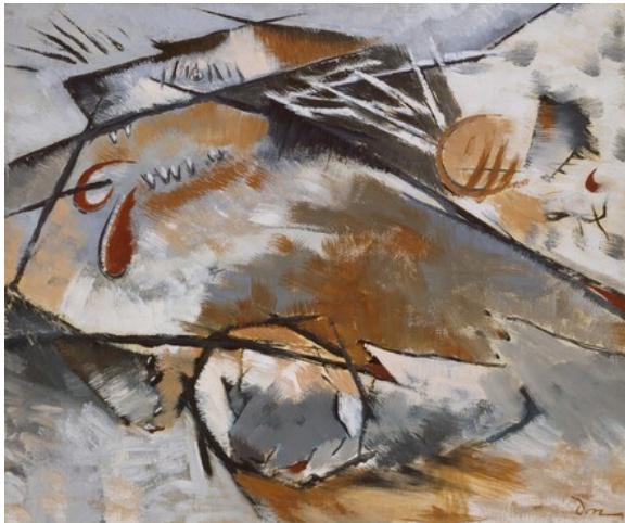
fig. 5 Arthur Dove, Dogs Chasing Each Other , 1929, oil on canvas, The Art Institute of Chicago, Alfred Stieglitz Collection.