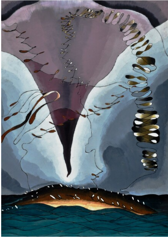
fig. 3 Arthur Dove, Seagull Motif (Violet and Green) , 1928, oil on metal, Collection of Pitt and Barbara Hyde