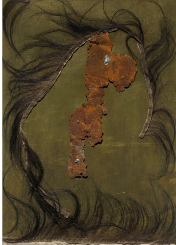
fig. 4 Arthur Dove, Monkey Fur , 1926, corroded metal, monkey fur, tin foil, and cloth on metal, The Art Institute of Chicago, Alfred Stieglitz Collection.