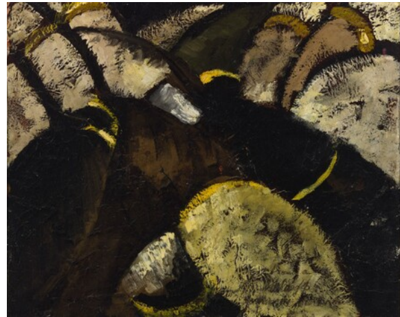
fig. 2 Arthur Dove, From a Wasp , c. 1914, oil on wood, The Art Institute of Chicago, Alfred Stieglitz Collection.