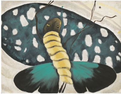
Arthur Dove American, 1880 - 1946